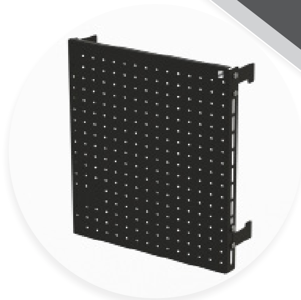
LAN STATION 15" X 18" PEGBOARD